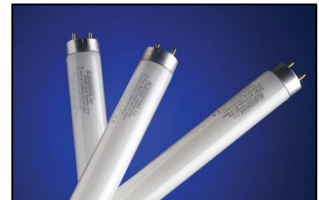
GTI lamps are manufactured with proprietary fluorescent phosphors that are unequalled by any other lamp in the industry. They produce a true full spectrum white light which renders colors with the highest degree of accuracy, color rendering, and efficiency.